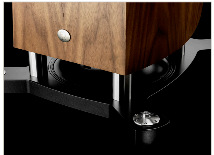
Close-up of precision-machined stand